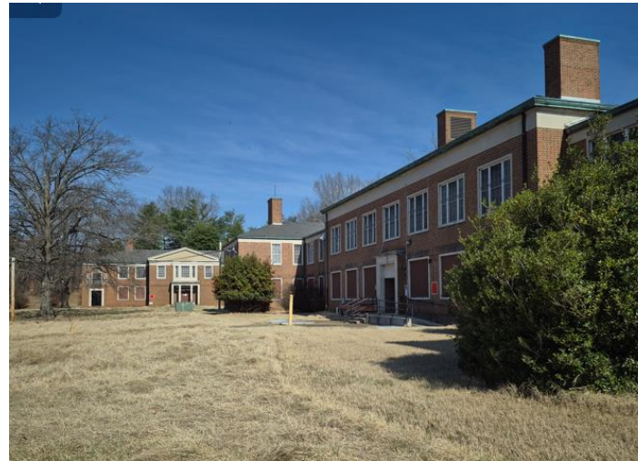
Building 14 (1954) & 16 (1958)