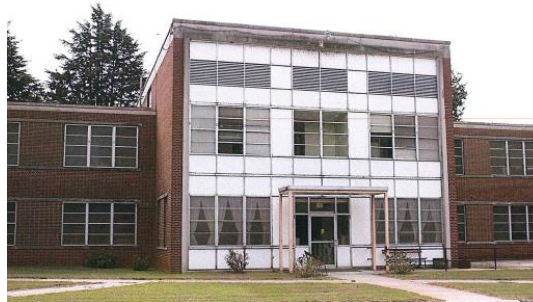
Building 7 (1964)

Buildings 6, 7, 8, 9, 10, 11, 12, 13, 14, 15, 16, 17, 18, 19, 20, 32, 33, 35, 35, 36, 41, 42, 43, 44, 45-5, 49, 51, 52, 53, 56, 57, 60, 64, 65, 66, 80, 81, 85, 87, 88, 91, 92