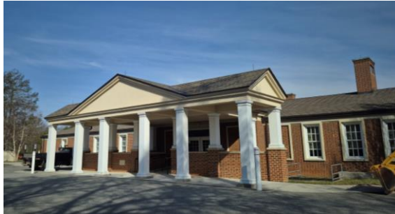
Building 10 (1955)