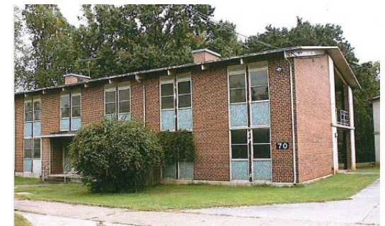
Building 70 (1967)