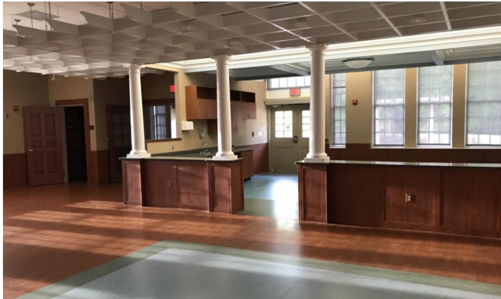
Building 12 Dayroom & Kitchen