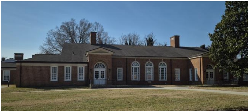
Building 11 (1951)