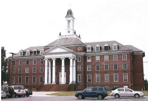
Building 1 (1937)

Buildings 1, 2, 4, 5, 21, 22, 23, 24, 26, 27, 28, 30, 36, 37, 38, 39, 45, 45:1-4, 48, 48-1, 54, 55, 55-A, 82