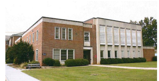
Building 50 (1969)

Buildings 31, 34-A, 40, 40-A, 40-B, 46, 47, 50, 59, 61, 62, 63, 68, 69, 70, 71, 72, 73, 74, 75, 76, 83, 89, 90