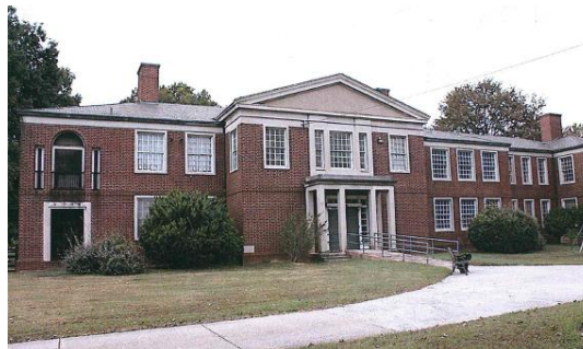
Building 15 (1958)