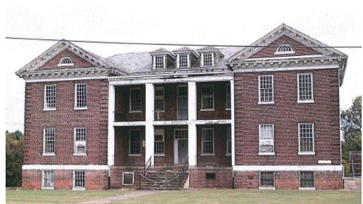
Building 22 (1910)