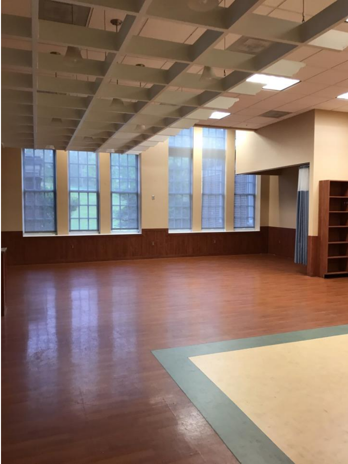
Building 8 Dayroom