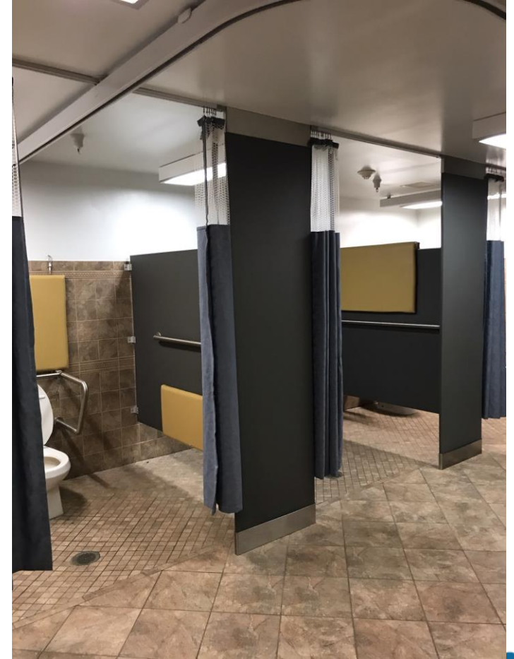
Building 8 Common Bathroom