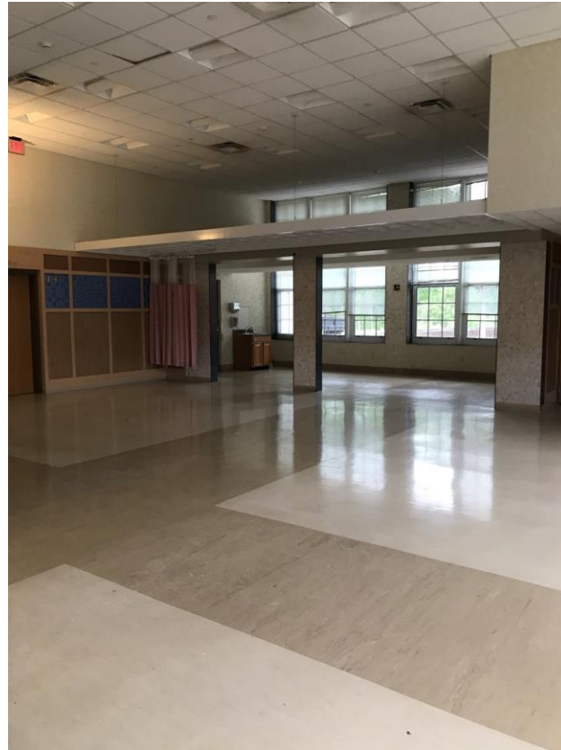
Building 11 Dayroom