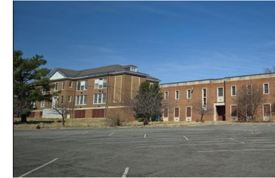
Building 49 (1950)