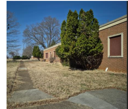
Building 60 (1960)