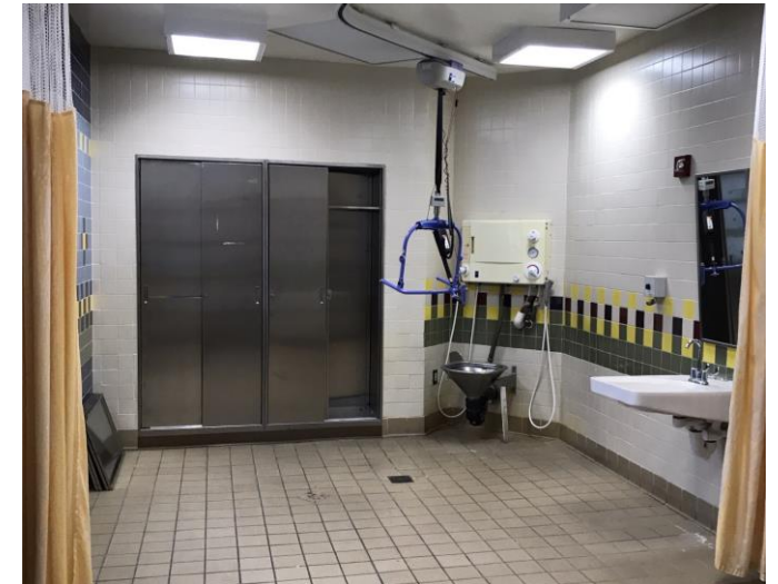
Building 11 Shower Trolley Room