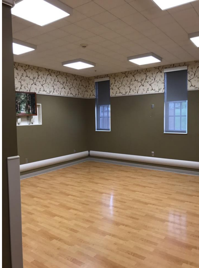
Building 8 Bedroom